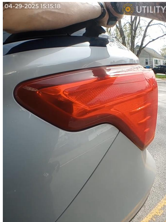
Figure 4: Camera view obstructed by cruiser