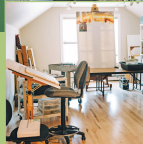
Allan's artist studio.

Call 207-725-4549 or 1-866-854-1200 to learn more. 2 Kingfisher Drive / Topsham, Maine / HighlandGreenLifestyle.com