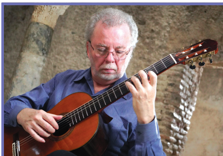
Manuel Barrueco plays Albéniz in the ancient Moorish baths of Granada.