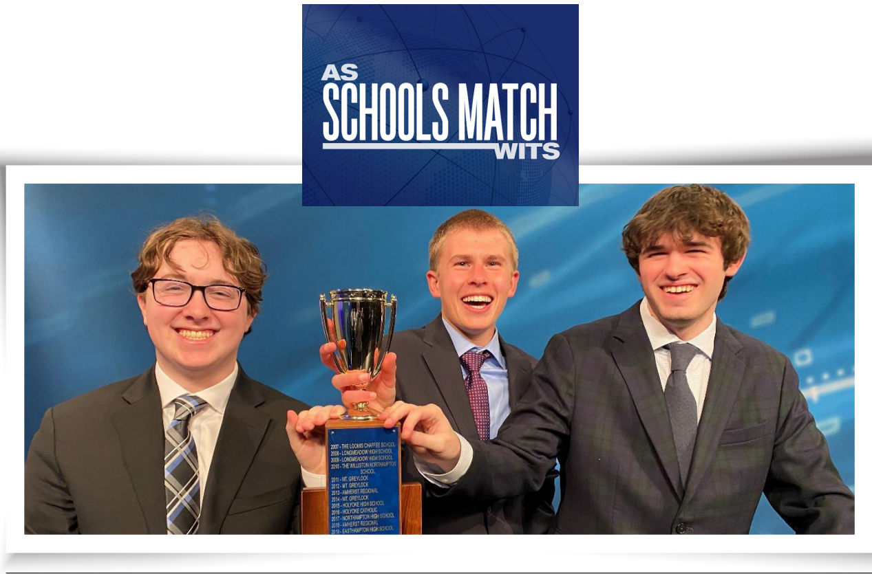
Longmeadow High School team members pose with the Collamore Cup after winning the May 28, 2022 championship match of "As Schools Match Wits" Season 61.