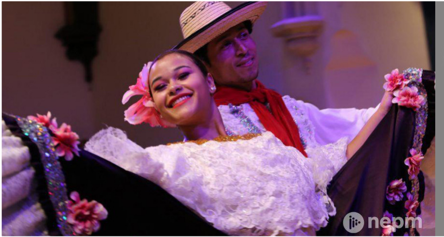
Festival Latino of the Berkshires Connecting Point / NEPM

NEPM strives to take an active role in the community by producing, hosting, and participating in a wide range of initiatives. Many of these efforts require personal representation while others require support and planning services, volunteer organization, materials and resources, or intellectual leadership and guidance. The NEPM Education Department provides learning opportunities and works closely with the community to improve outcomes for youth, families, educators, students, and community partners.