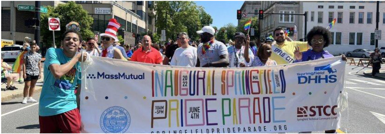
Marchers during Springfield, Massachusetts, first Pride parade held on June 4, 2022