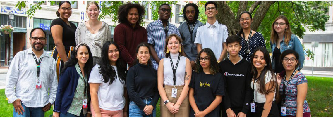
NEPM Media Lab 2021 participants, mentors and facilitators NEPM

The NEPM Media Lab introduces youth to the world of media creation and production.