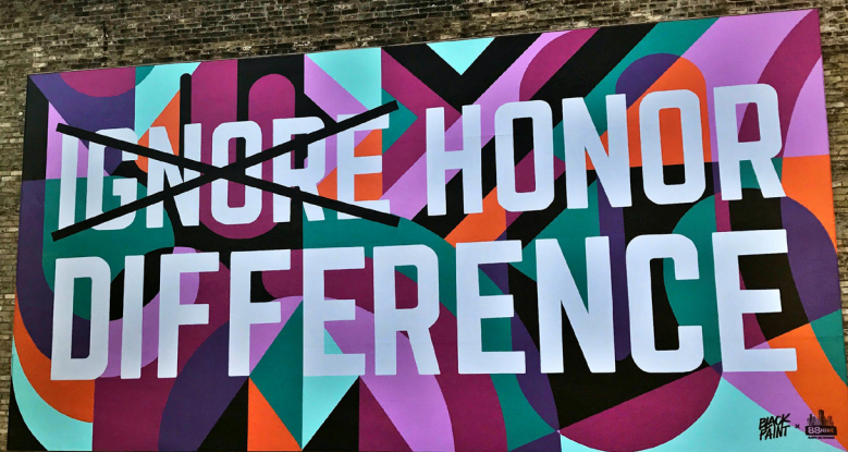
88NINE MURAL AT VAR GALLERY WITH BLACKPAINT STUDIOS