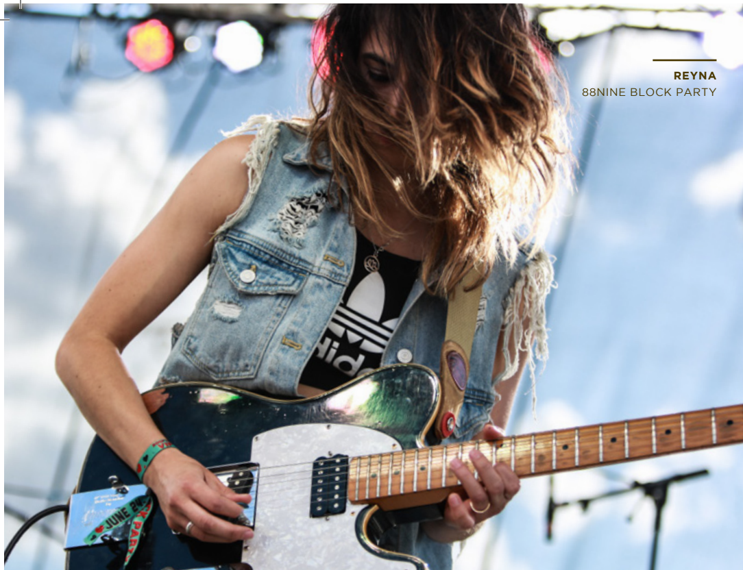
REYNA 88NINE BLOCK PARTY