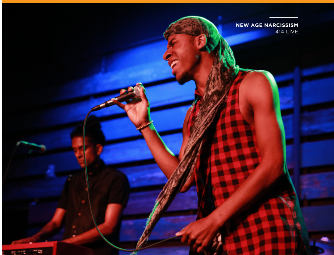
NEW AGE NARCISSISM 414 LIVE