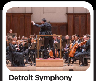
Orchestra Live Fri., Oct. 14 10:40AM | 90.5FM