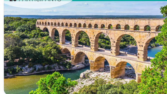
Pont du Gard