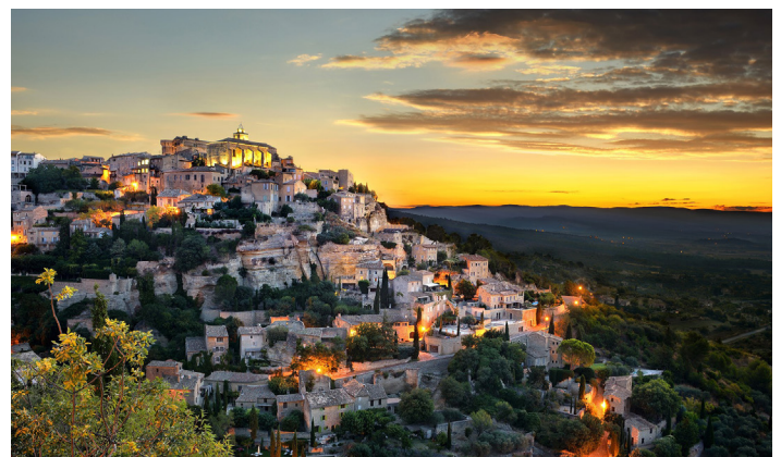
Village of Gordes

Our first full day in the City of Light begins with a visit to the glorious Cathedral of Notre Dame, splendidly restored after its recent conflagration. Afterwards our private guide James, one of the best