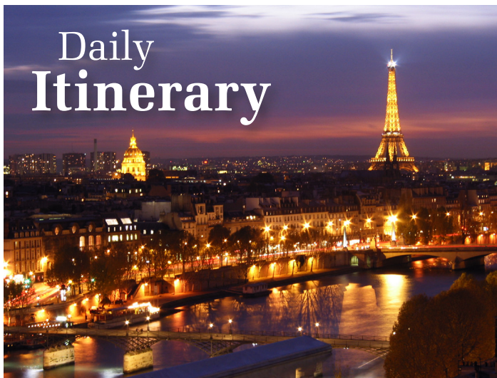
Paris night panorama