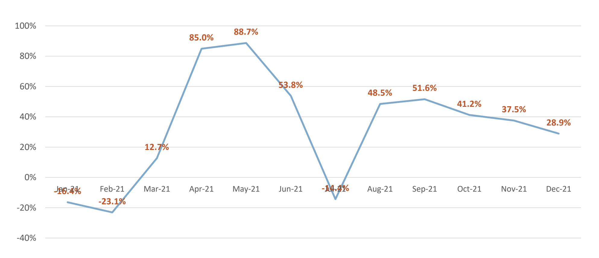
GF Collection MoM% month compared to same month from previous year