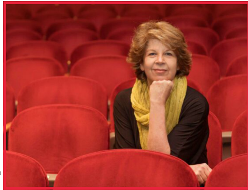
Meg Wolitzer / Selected Shorts