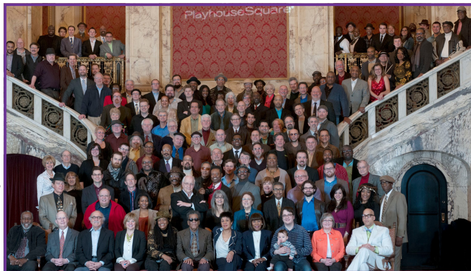
Tri-C JazzFest / A Great Day in Cleveland