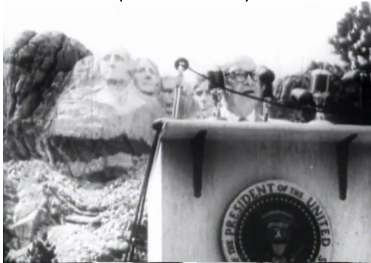
Still from Film: Dwight Eisenhower at Mt. Rushmore

The following clip ( Watch ) contains two newsreel films. In the second, Roosevelt is shown speaking extemporaneously about the significance of Mount Rushmore and its place in history.