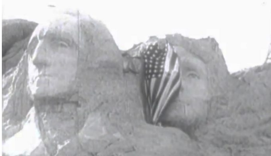
Still from Film: FDR at Mount Rushmore – 1936

On August 30, 1936, President Franklin Delano Roosevelt visited the Black Hills to dedicate the Jefferson sculpture. Roosevelt was already in the region on a tour of Great Plains states, which were hard hit by the drought of the 1930s.