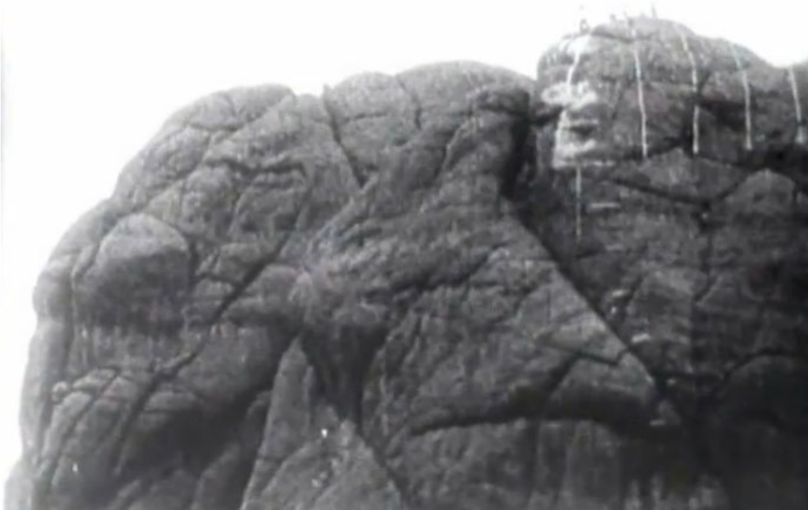
Still from Film: Calvin Coolidge at Mt. Rushmore – 1927