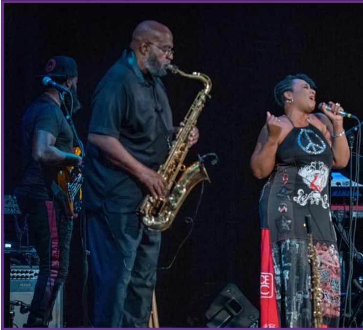
Rubber City Jazz and Blues Festival