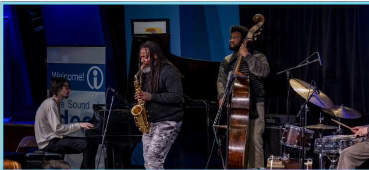
Matt Crow / Ideastream Public Media

To learn more, visit rubbercityjazz.org .