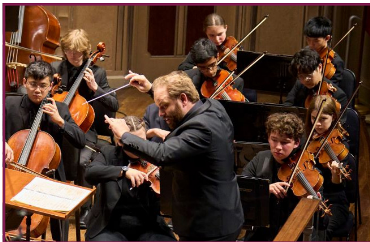
The Cleveland Orchestra Youth Orchestra