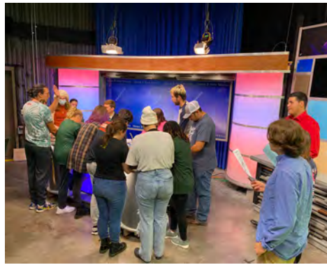
KENW students have meeting before going live!