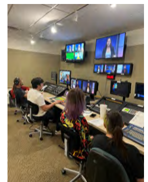
ENMU Students during live News 3