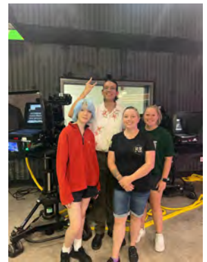
KENW students bring the news to our surrounding areas