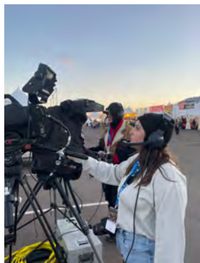
Students on cameras for the production of Balloon Fiesta 2023