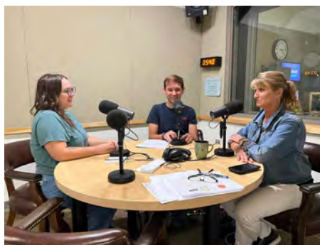
ENMU Students help with FM Fall Pledge- 2023