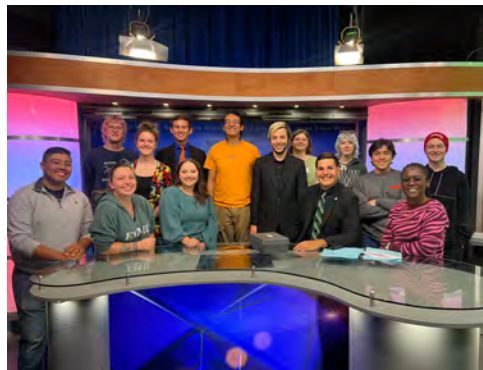
News 3 New Mexico crew 2023