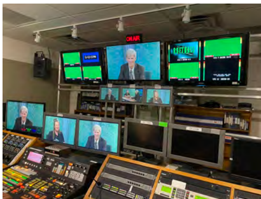
Behind the scenes of taping of SportsLook