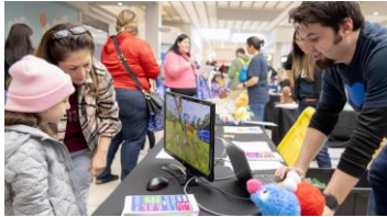
Above: Attendees at PBS El Paso Kids Fiesta