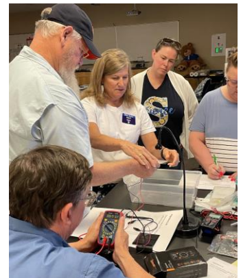
Above: Participants in 2023's AP Summer Institute in Lubbock

With limited professional development opportunities for El Paso educators, this academy offered a robust training opportunity, partially funded by a grant. Sixty educators attended this year's academy.