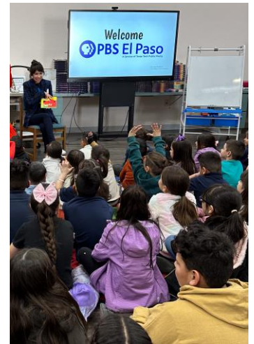
Above: PBS El Paso at the Read Across America event at REL Washington Elementary.

PBS El Paso also took part in other community activities such as literacy and career day events at elementary schools and PBS Kids screenings. Total participation in 2023 was about 8,000 people.