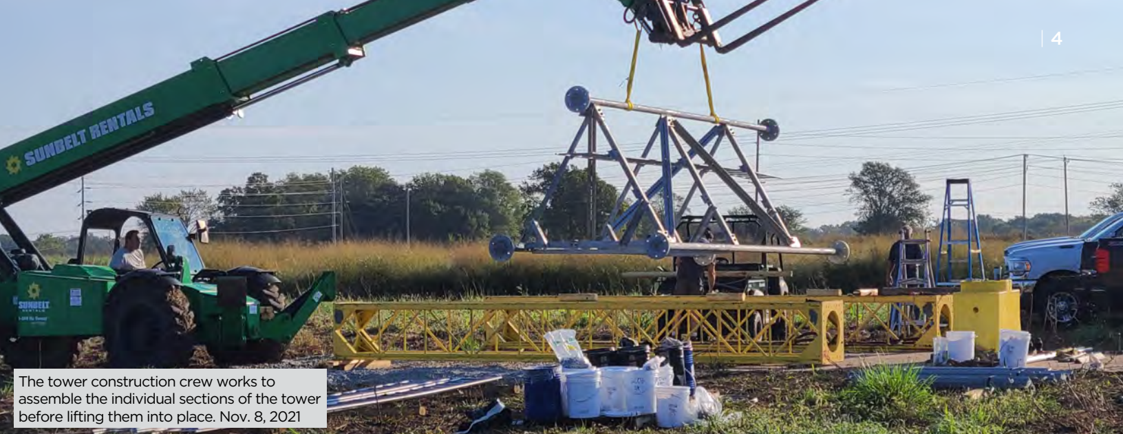
The tower construction crew works to assemble the individual sections of the tower before lifting them into place. Nov. 8, 2021