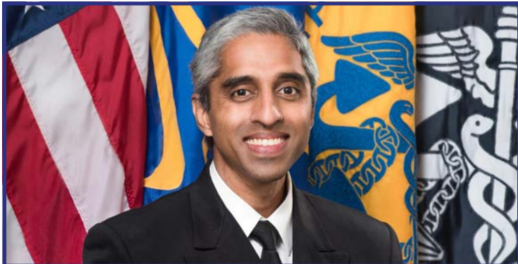
U.S. Department of Health and Human Services