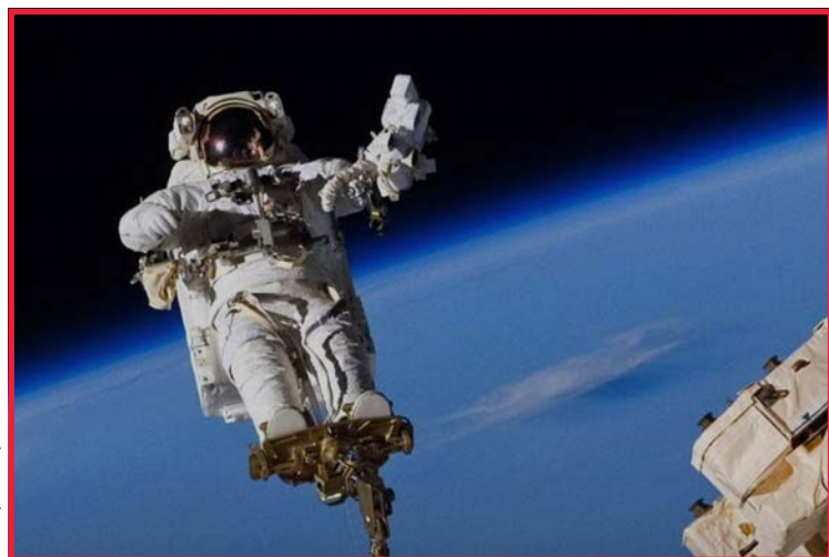
NOVA / GBH / PBS