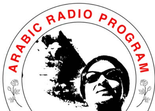
Arabic Radio Program