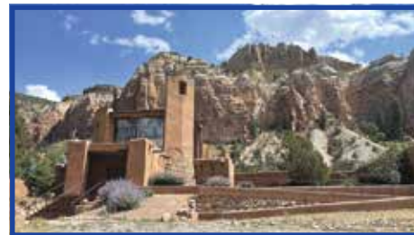
Monastery of Christ in the Desert

Cultura has been a KENW production since the mid '70s. Each episode is an exploration into the history, people, and places that make the Land of Enchantment and surrounding areas unique.