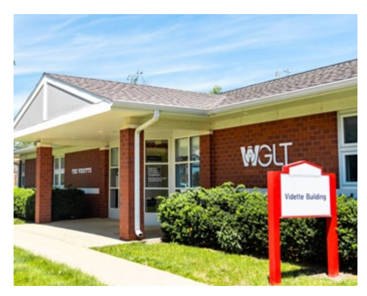
WGLT's new location in the former Vidette building.

On January 16, WGLT relocated to a new location in the former Vidette building on the Northwest side of the Illinois State University campus at Locust and University. The move culminated a