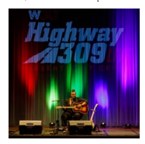
Crys Matthews during Highway 309 LIVE.

Looking ahead to 2025, we anticipate a challenging year. Challenges around a free press, public media funding and FCC licensing. In hyper-political and polarized times, we know the public ser-