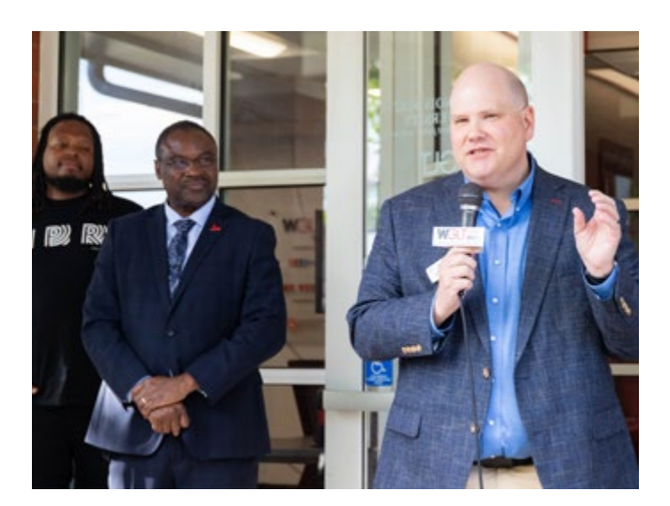
WGLT's ribbon cutting ceremony and open house.

The station's service expanded in other ways. March featured our "21 Women Who Shaped Bloomington-Normal" on-air and online series complemented by an all-women line-up for Highway 309 Live. Over the summer, WGLT staff launched WGLT Shorts, a new ongoing short-form video program to establish a presence for our journalism on YouTube, Instagram, and Tik Tok. In the Fall we reintroduced hourly on-air local newscasts from 9 a.m. to 3 p.m., so that local newscasts can be heard every hour from 6 a.m. to 7 p.m.