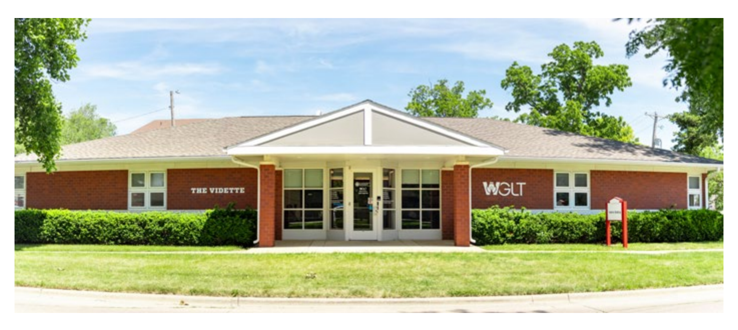
The renovated building features five studios and a technology server room, all outfitted with new equipment funded by generous WGLT donors.