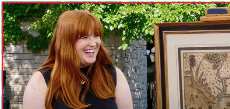
GBH / PBS