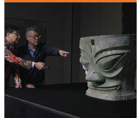
China's Bronze Kingdom • Explore China's bronze kingdom in the mountains of Sichuan.