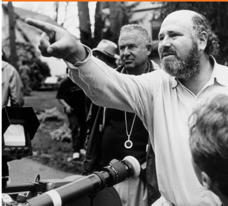
Celebrate the extraordinary work and remarkable career of Rob Reiner.