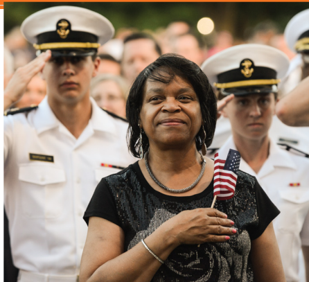
Joe Mantegna and Gary Sinise once again host the National Memorial Day Concert.