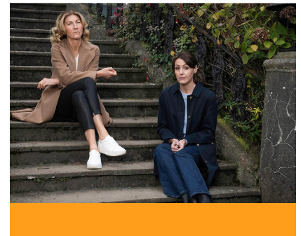
MARYLAND ON MASTERPIECE "Episode 1"

The security chief is found dead, and an infamous green diamond has gone missing.