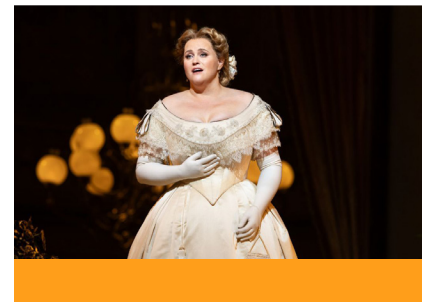
Great Performances at the Met "Arabella"

Sisters Becca and Rosaline receive unimaginable news about their mother.