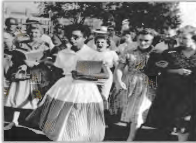
Image No. 2: Central High student Elizabeth Eckford of the Little Rock 9 is taunted and threatened on her way to class on the first day of the 1957 school year.

September 4, 1957, the first day of class, these students—soon christened “The Little Rock 9”—were the targets of violent white mobs, as depicted in the iconic image of 15-year-old Elizabeth Eckford navigating her way to class through the hate, threats and jeers. See Image No. 2.