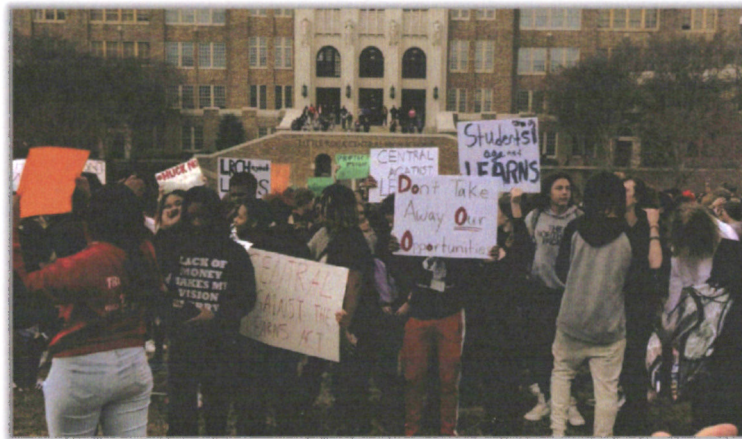
Image No. 4: Central High students protest GOV. SANDERS' LEARNS bill on March 3, 2023.

71. On March 3, 2023, scores of racially diverse Central High students held a mass “walk-out” in protest of the LEARNS Act legislation and governmental attempts to stifle their First Amendment rights, an event which captured local, regional and national attention. See Image No. 4 below.