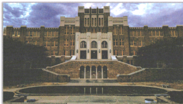
Image No. 1: Central High School in Little Rock, Arkansas.

22. Central High opened its doors to Little Rock students in 1927. See Image No. 1.