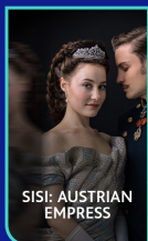
SISI: AUSTRIAN EMPRESS