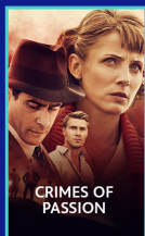
CRIMES OF PASSION