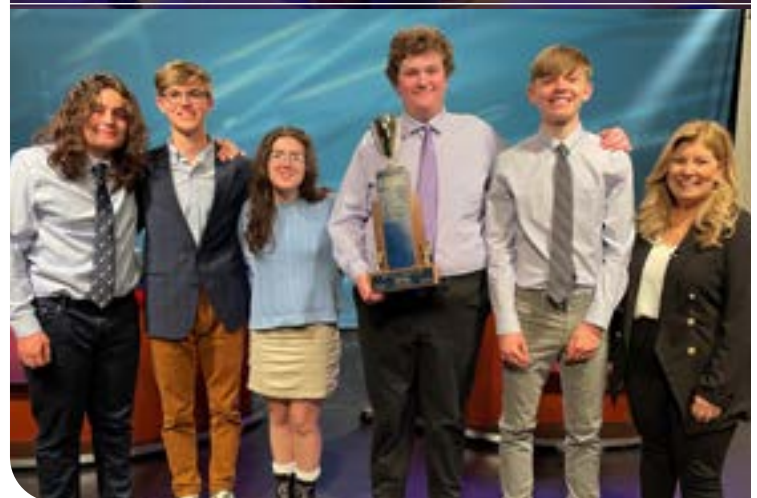
Lenox Memorial High School team members pose with the Collamore Cup after winning the championship match of "As Schools Match Wits" Season 62. The match was broadcast on NEPM TV on June 24, 2023.

ASMW is produced by both NEPM and Westfield State University (WSU), which provides the production facilities and student production crew. ASMW offers a real-world learning environment for the television production students in WSU's Department of Communication. Questions for "As Schools Match Wits" are written in accordance with Massachusetts and Connecticut state high school curriculum guidelines. The program won a 2023 New England Emmy nomination for Outstanding Education/Schools Program.