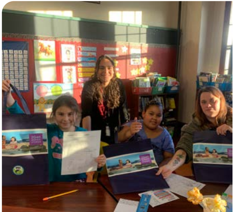
NEPM and Homework House co-hosted a read aloud in Holyoke.

A distinguished cohort of GBH-NEPM Educator Ambassadors for Massachusetts form our local leadership group that advises us on a broad range of topics and provides feedback on our educational content development and teacher engagement each year. The ambassadors span the state geographically, and are diverse in the subjects, grades, and students they teach. We are committed to supporting teachers in using our resources and to handing the mic to educators so that we and their peers can learn from their expertise.