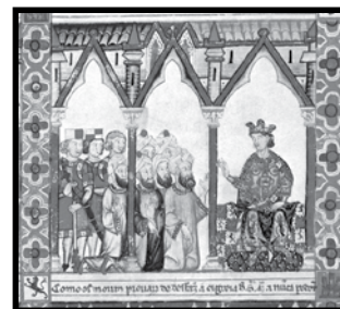
In 13th century Spanish artwork, Christians, Muslims and Jews are often depicted working together.

From 711, when Muslim armies swept across the Mediterranean, until 1492, when Christian power was consolidated under King Ferdinand and Queen Isabella, the era lasted almost 800 years. During this period, the intermingling of these three groups led to a vibrant shared culture of arts, architecture, science, music, and letters, raising Spain to dazzling heights of glory and power.