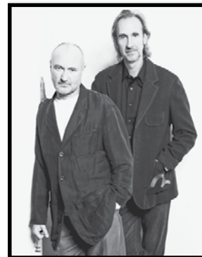
(LtoR): Phil Collins and guitarist Mike Rutherford

Genesis: When in Rome 2007 can be seen on 3-2 Thursday, the 2nd at 8:30 p.m.