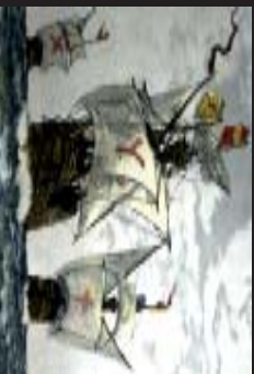
Columbus sets sail with the Nina, Pinta, and Santa Maria.

Jewish roots. Their complex journeys across continents and oceans with ever-changing names and identities is masterfully described by the leading historians of the Sephardic diaspora.