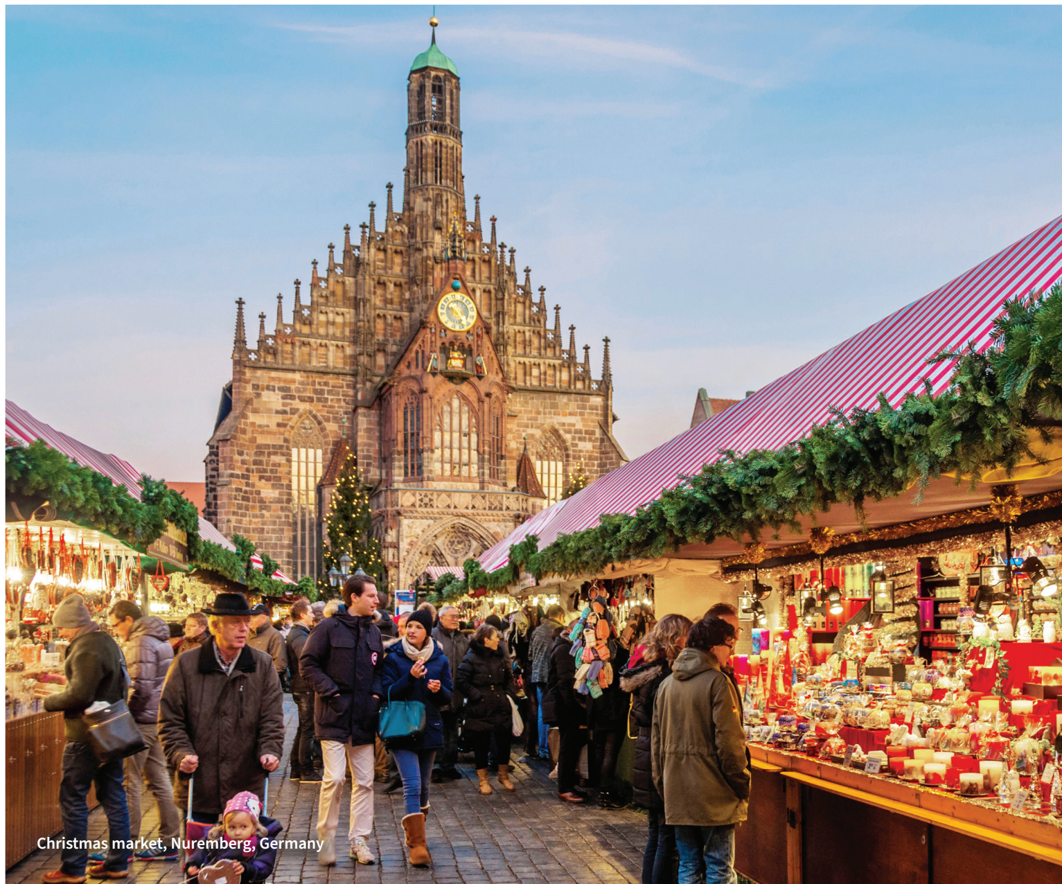
Christmas market, Nuremberg, Germany