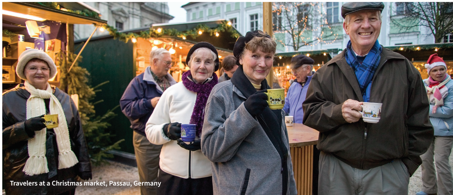
Travelers at a Christmas market, Passau, Germany