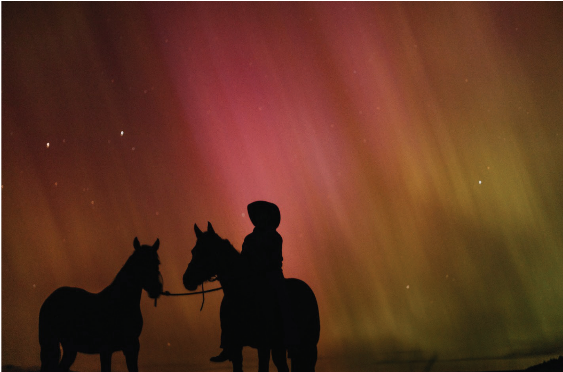
McKenzy Ellisen - Under the Lights in Meeteetse, Wyoming

Biography – McKenzie grew up in Seattle, where she first learned photography in a darkroom before moving into digital work. At 19 she relocated to Wyoming and began photographing local brandings and gathers. She’s driven by a passion for preserving the western lifestyle, from the energy of rodeos to quiet moments beneath the northern lights.