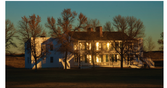
Michael Evans - Old Bedlam at Fort Laramie National Historic Site. Built in 1849, is Wyoming's oldest standing building.