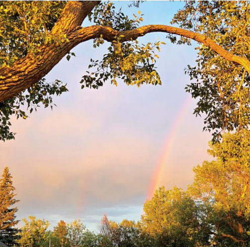
Wendy Lowe - Stormy Rainbow