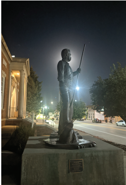
John Wesley Powell Monument in moonlight. John Wesley Powell is remembered for numerous expeditions of the American West in the 1860's and 1870's, most notably his Colorado River Exploring Expeditions of 1869 and 1871.