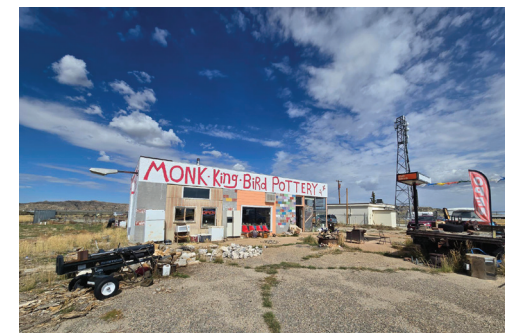
Janel Seeley - Ghost Town Potter