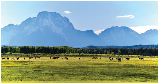
Dorina Kemper - Wyoming beauty, Grand Teton.