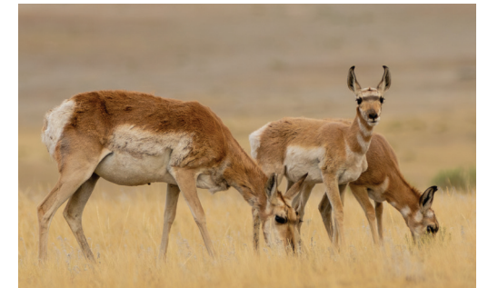
Leo Beach - The Antelope are a steadfast reminder of the grit, perseverance, and determination it takes to survive on the plains of this beautiful state.