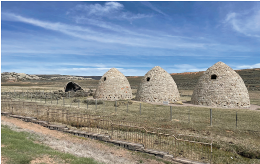
Laima Swanson - Conical-Shaped Charcoal Kilns Built from Local Sandstone and Limestone in the Historic Town of Piedmont, Wyoming.