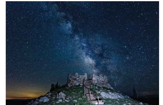
Lane Tomme - Libby Flats, 2016 WPM Photo Contest