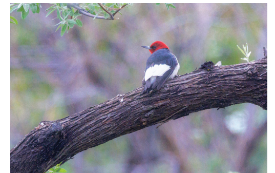
Susan Nelson - Red-Headed Woodpecker