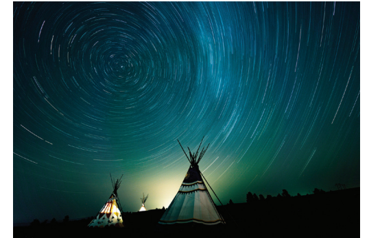
Ahmad Ansari - Tipi at Night, 2022 WPM Photo Contest