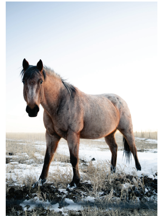
Dylan Stielow - A Crisp Wyoming Evening