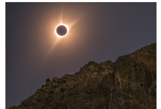
Christopher Martin - Solar Eclipse, One of the 2017 WPM Photo Contest