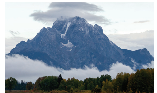
Austin Handley - Cloudy Mount Moran. An early foggy morning at Mount Moran in the Tetons.