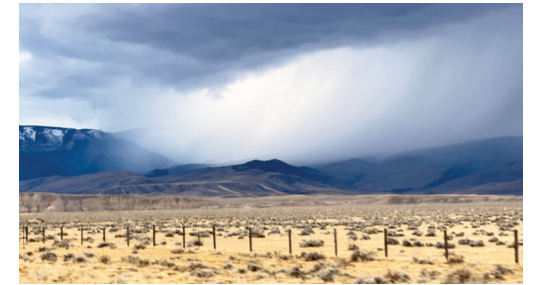
Felicia Canfield - Prairie view of Beartooth drama