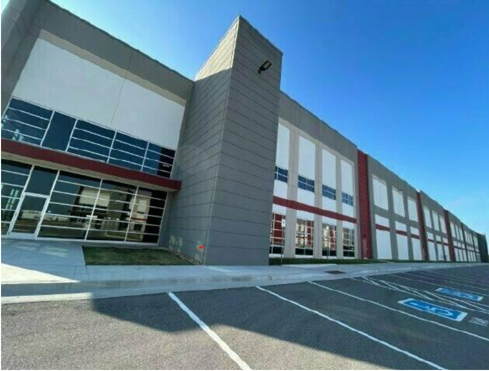
Figures 3-6: Interior and exterior of the subject property.

RE: ICE New Oklahoma City Processing Center, 2800 S Council Rd, Oklahoma City, Oklahoma, 73128