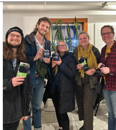
One of our winning teams at the Maine Beer Co. in Freeport.

challenging – if you've followed the news, you'll do just fine! It's all about coming together at some cool venues and having fun with your friends. To register a team, come up with a team name and let us know what night you will be attending and the number of people on your team. You can register by going to mainepublic.org and clicking on our Community tab. We hope to see you! ■