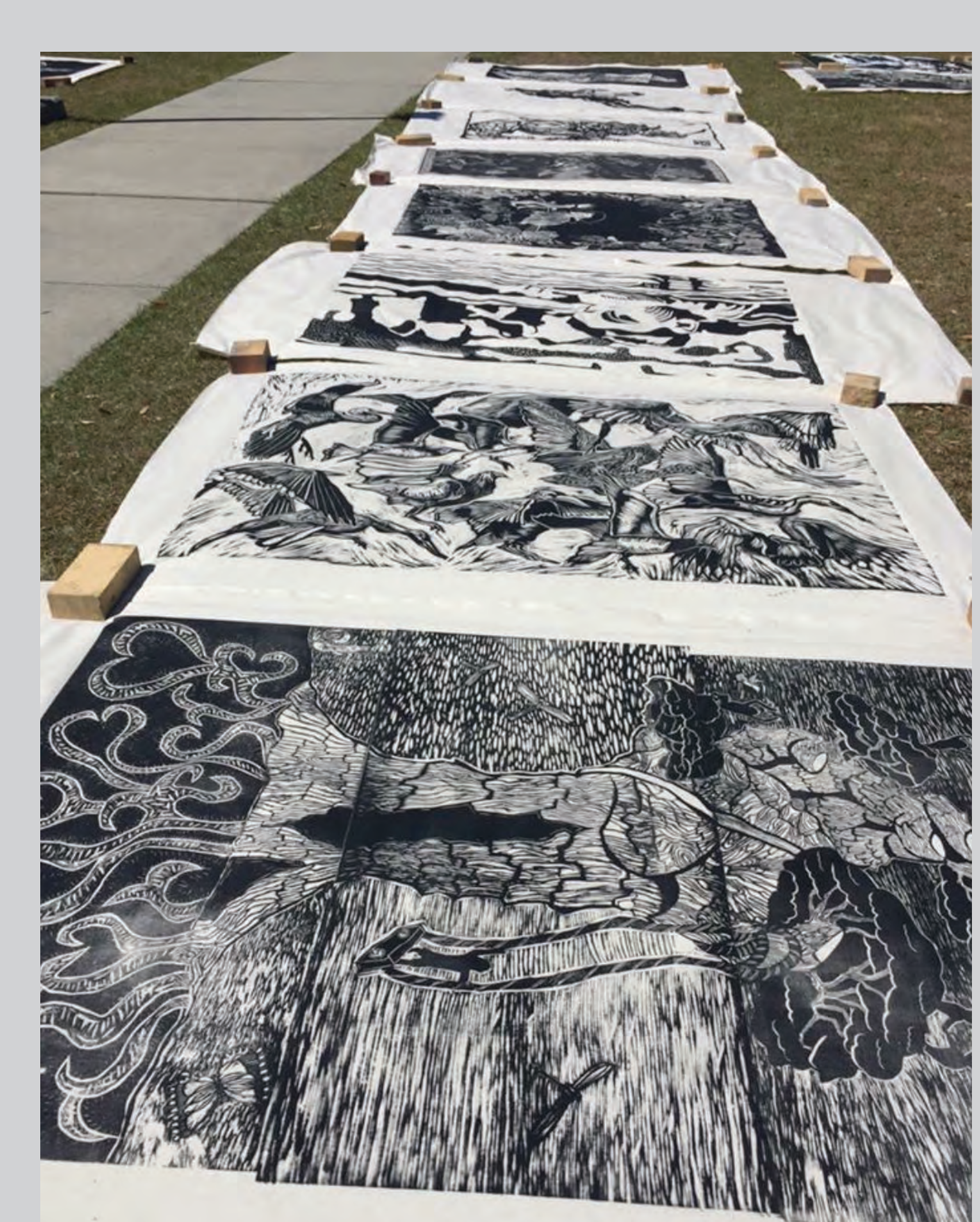
Drying the finished prints...