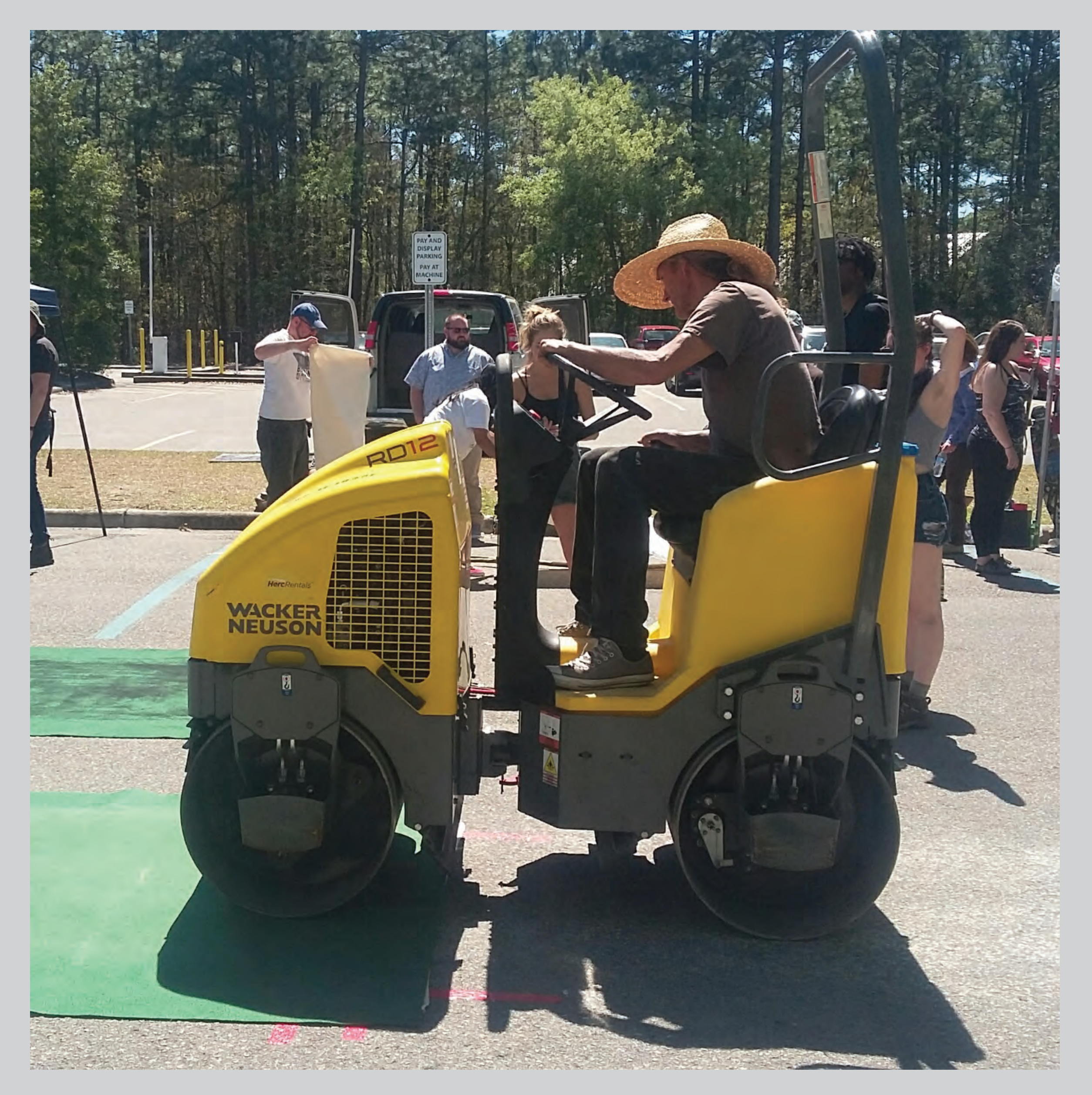
Using the paving roller as a printing press...

Using a construction paving roller and an unlikely press bed - the front parking lot of the Cultural Arts Building - a team of artists and volunteers work collaboratively to print large-scale woodcuts throughout the day.