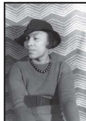
Zora Neale Hurston was friends with Carl Van Vechten, famed photographer during the Harlem Renaissance, who took this portrait on April 4, 1935.

American Experience “Zora Neale Hurston: Claiming a Space” airs on 3-2 Tuesday, the 17th at 8:00 p.m. On 3-1, it airs Monday, the 23rd at 7:00 p.m.