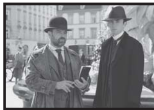
(LtoR): Oskar and Max

Vienna Blood returns for a third season of six new diabolical cases. Set in 1908 Vienna, the series finds English doctor Max Liebermann and tenacious Detective Inspector Oskar Rheinhardt working as an established crime-solving duo, having cracked several of the city’s most mysterious and deadly cases.