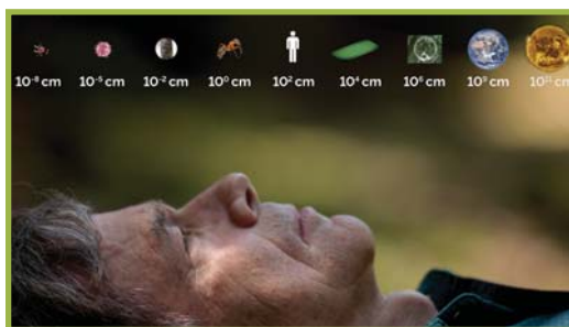
"Our Sun is a star close-up." (Carl Sagan) CGI shows how our size is almost exactly halfway between an atom and a star.

We travel to the prehistoric caves of Font-de-Gaume in France, where drawings and symbols suggest that—as long ago as