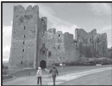
Bolton Castle on Herriot’s Way

The Herriot Way airs on 3-2 Sunday, the 1st at 8:30 p.m. It can be seen on 3-1 Sunday, the 1st at 7:30 p.m. and Monday, the 2nd at 1:00 p.m.