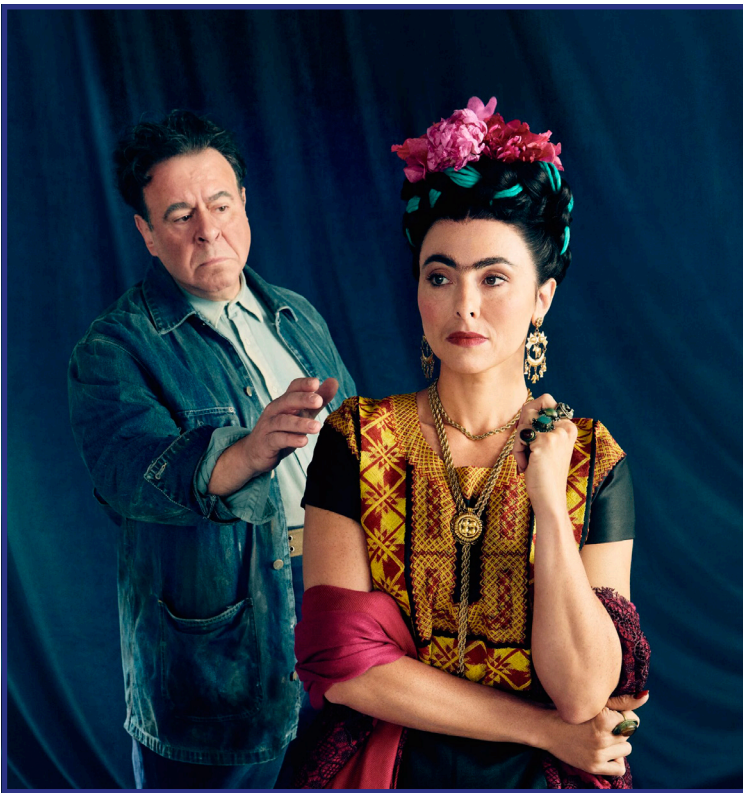
The Metropolitan Opera

Celebrate Memorial Day on WCLV. We'll highlight music from American composers throughout the day to honor those who gave their lives while serving. In addition, you'll hear music from films which tell timeless stories of valor and sacrifice, such as Saving Private Ryan , Glory , Platoon , and more.