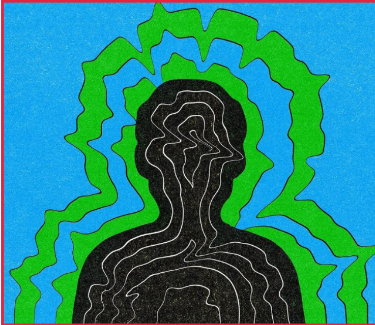
Call to Mind / Luke Mills