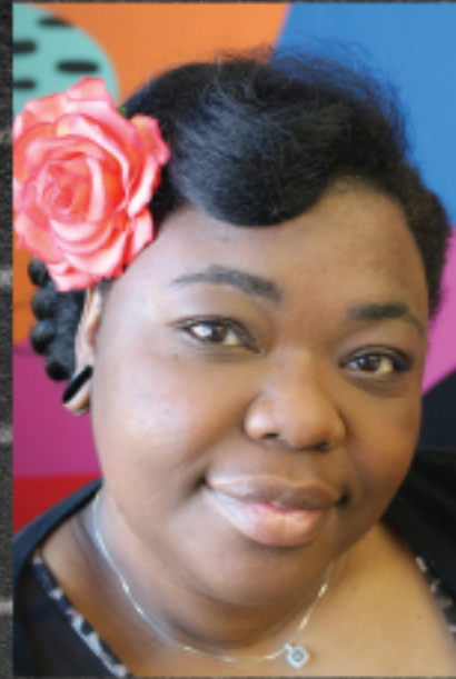
element everest-blanks Weekend DJ