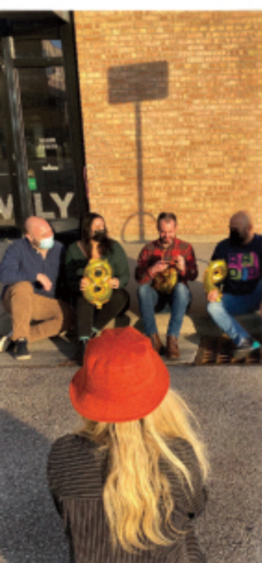
Above: Team Programming loves skipping class, hanging out.