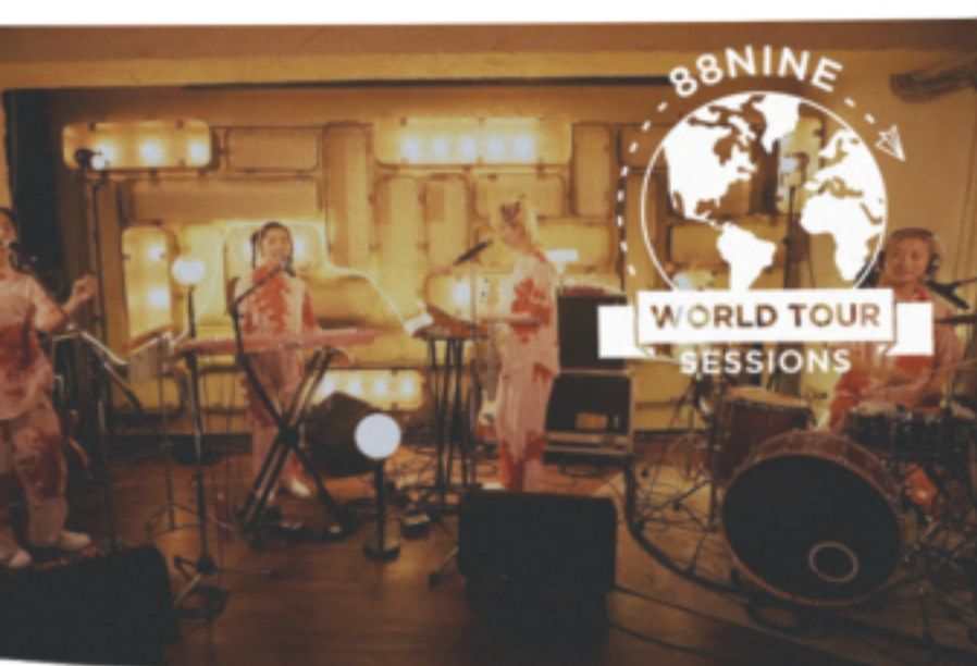
Above: The World Tour continues with a live broadcast from the incomparable CHAI, all the way from Nagoya, Japan.

And on November 5, we finally hosted our first in-person Session with Zella Day!