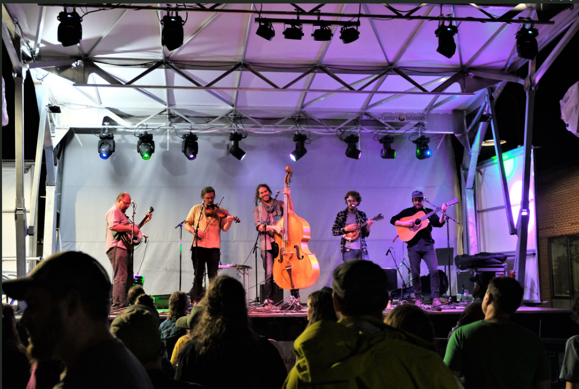
Chicken Wire Empire performing at Project North

After a two-year break, in September 2022 WXPB partnered with ArtStart, the Rhinelander Chamber of Commerce and Nicolet College to present the second Project North – music, art, and sustainability festival. The festival featured over 1100 attendees, 100 musicians and artists, 100 community members, 16 hours of live radio broadcast and an estimated economic impact of almost $100,000!