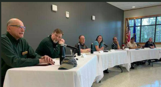
Beyond the Headlines- Wisconsin's Water Future Partnership with WI Humanities Council