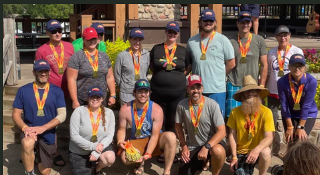
WXPB's Dragon Boat Team- A fundraiser for the Howard Young Foundation

WXPB staff and volunteers continue to travel throughout the community meeting listeners and expanding partnerships. From Ironwood to Wausau, WXPB partnered with local arts, human service, and educational organizations with the overall goal of community connectedness.