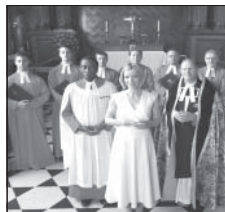
Host and historian Lucy Worsley

Henry VIII loved religious music, but he loved power more. When he instigated his English Reformation, he dramatically split from the ancient Catholic church that controlled much of his country. But in doing so, set into motion changes that would fundamentally transform the religious music he loved.