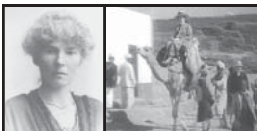
British explorer and spy Gertrude Bell was known as the "female" Lawrence of Arabia.

Using never-before-seen footage of the region shot a century ago, the film chronicles Bell's extraordinary journey into both the