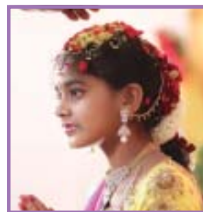
This young woman is a celebrant in the Hindu half-sari celebration.

Sacred can be seen on 3-2 Monday, the 10th at 9:00 p.m. and Sunday, the 16th at 10:00 p.m. On 3-1, it airs Sunday, the 16th at 9:00 p.m.