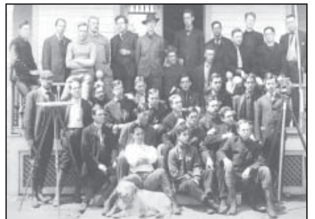
Yale School of Forestry, Class of 1905

American Experience "The Big Burn" airs Tuesday, the 3rd at 8:00 p.m. and Sunday, the 8th at 10:00 a.m. and 10:00 p.m. On HD3-1, it airs Tuesday, the 3rd at 8:00 p.m. and Wednesday, the 4th at 7:00 a.m. and 1:00 p.m.