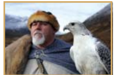
A Viking reenactor and a Gyrfalcon in the snowy landscape of the Alladale Wilderness reserve in Scotland.

"Wild Way of the Viking" on Nature airs on 3-2 Wednesday, the 13th at 7:00 p.m. and Saturday, the 16th at 11:00 p.m. On 3-1, it airs Wednesday, the 13th at 9:00 p.m., Thursday, the 14th at 2:00 p.m., and Monday, the 18th at 6:00 a.m.