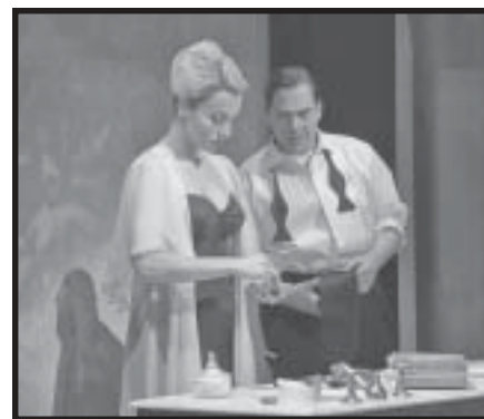
Isabel Leonard stars as “Marnie” and Christopher Maltman is Mark Rutland.

“Marnie” on Great Performances at the Met airs on 3-2 Friday, the 1st at 9:00 p.m. On 3-1, it airs Saturday, the 2nd at 7:00 p.m.