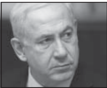
Israeli Prime Minister Netanyahu

tinians unfolding and Israel-US relations already emerging as a 2016 campaign issue, Frontline presents "Netanyahu at War," an epic documentary tracing Netanyahu's path to power, his combative relationships with multiple US presidents, and the implications in America and the Middle East.