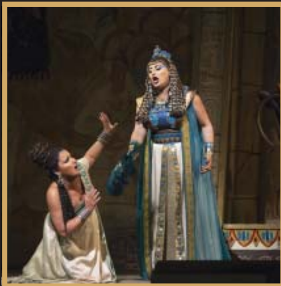
AIDA, Verdi's grand opera featuring his most celebrated arias, stars vocal powerhouse Anna Netrebko (left) in the title role on GREAT PERFORMANCES AT THE MET. On 3-1 only.