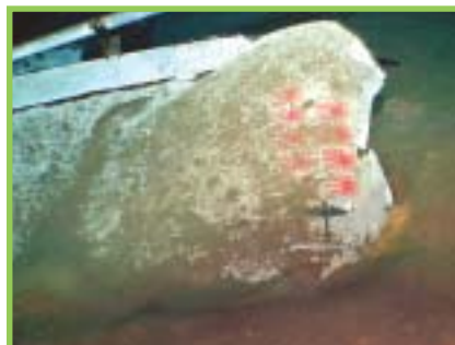
Shown is a portion of the starboard wing of the USS Indianapolis on which the ship’s crew painted her scorecard, which records the number and types of enemy war materiel the crew destroyed in combat. The nine Japanese flags indicate the number of aircraft shot down by the ship.

USS Indianapolis: The Final Chapter will be broadcast on 3-2 Tuesday, the 8th at 9:00 p.m. and Thursday, the 10th at 7:00 p.m. On 3-1, it can be seen Monday, the 14th at 7:00 p.m.