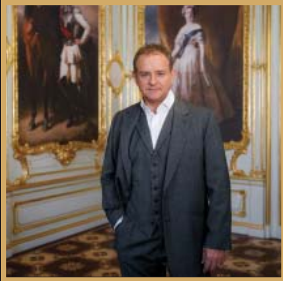
Ring in the New Year with FROM VIENNA: THE NEW YEAR'S CELEBRATION 2019 with host Hugh Bonneville and featuring favorite Strauss Family waltzes and the Vienna City Ballet.