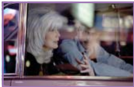
Emmylou Harris is shown in Elvis' Rolls Royce.

From Tupelo to Memphis to New York, Las Vegas, and countless points between, the journey explores the rise and fall of Elvis