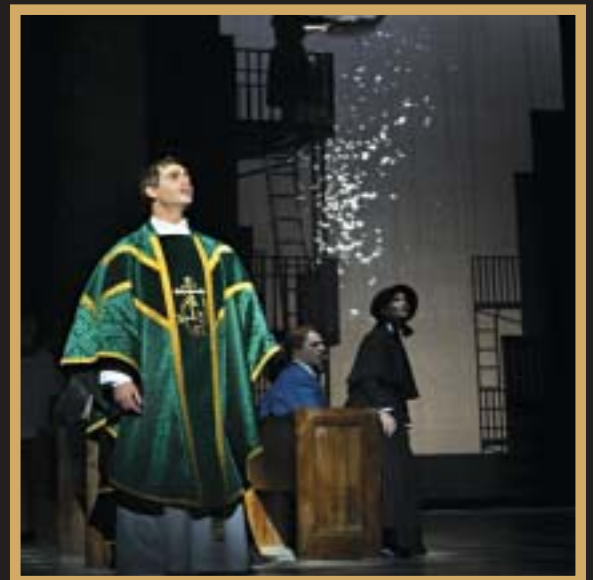
DOUBT FROM THE MINNESOTA OPERA is an adaptation of John Patrick Shanley's hit Broadway play about suspicion leading to a battle of wills at a Bronx Catholic school.