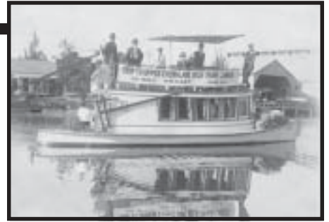
Boat with sign: "Trip to Upper Everglade Rich Farm Lands"

"The Swamp" on American Experience can be seen on 3-2 Tuesday, the 15th at 8:00 p.m. On 3-1, it airs Monday, the 21st at 7:00 p.m.