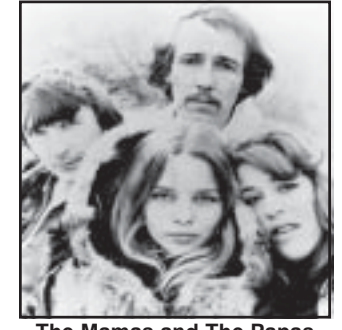
The Mamas and The Papas

1965-1967 Rock Rewind can be seen Saturday, the 29th at 8:30 p.m.