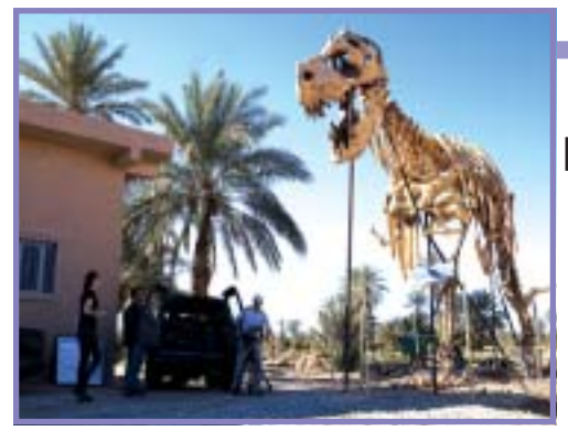
This dinosaur fossil stands outside a museum in Erfoud, Morocco.

tor ever to walk the Earth. But these spectacular fossil bones, from a dinosaur dubbed Spinosaurus, were completely destroyed during a World War II Allied bombing raid, leaving only drawings.