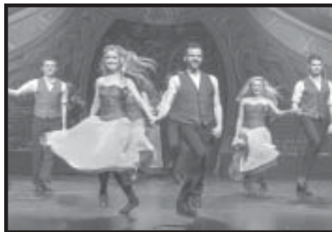
Rhythm of the Dance

Rhythm of the Dance will be broadcast on 3-2 Thursday, the 29th at 7:00 p.m. On 3-1, it airs Sunday, the 25th at 6:30 p.m.