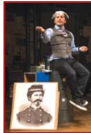
John Leguizamo's Road to Broadway