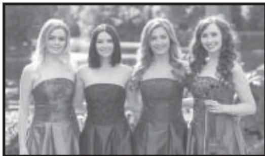
Celtic Woman – Ancient Land

Celtic Woman—Ancient Land airs on 3-2 Saturday, the 24th at 7:00 p.m. and Thursday, the 29th at 8:30 p.m. On 3-1, it can be seen Sunday, the 25th at 8:00 p.m.