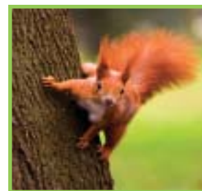
A flexible ankle joint allows squirrels to run headfirst down trees.

From tiny chipmunks to big prairie dogs, the squirrel family is one of the most widespread on Earth. There are almost 300 species of squirrels that can outwit rattlesnakes, survive the coldest temperatures of any mammal, and glide through the air using a parachute-like membrane between their wrists and ankles. What is the secret to their success?