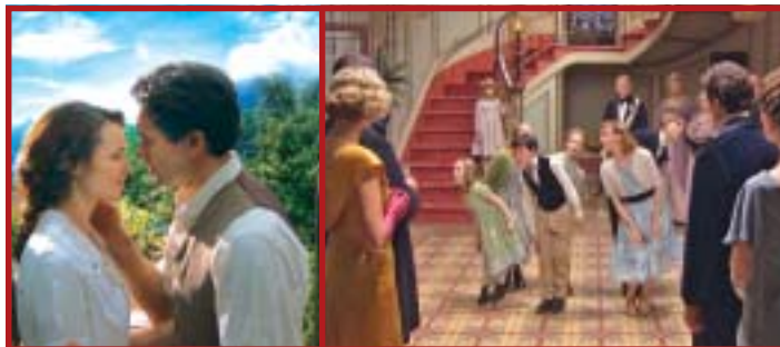
Rodgers & Hammerstein's The Sound of Music

Great Performances "Broadway's Best" airs on 3-2 Fridays at 9:00 p.m. beginning the 2nd (except 30th). On 3-1, the series airs Saturdays at 7:00 p.m. beginning the 3rd (except 24th), with "Harold Prince: A Director's Life" airing on Monday, December 3rd at 7:00 p.m.