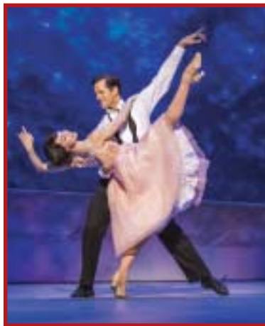
An American in Paris The Musical