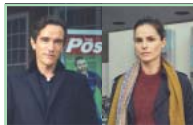
(LtoR): Ben Chaplin plays the Editor of fictional tabloid newspaper, The Post , and Charlotte Riley plays the News Editor of fictional newspaper, The Herald .