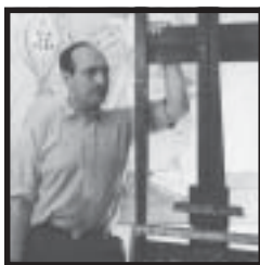
Rothko with "Slow Swirl by the Edge of the Sea," c. 1944-45

"Rothko: Pictures Must Be Miraculous" on American Masters explores the life of the celebrated artist whose luminous color