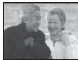
Emperor Akihito and Michiko

Emperor Akihito airs on 3-2 Sundays at 11:00 a.m./11:00 p.m. beginning the 27th. On 3-1, it can be seen Wednesdays at 7:00 p.m. beginning the 30th.