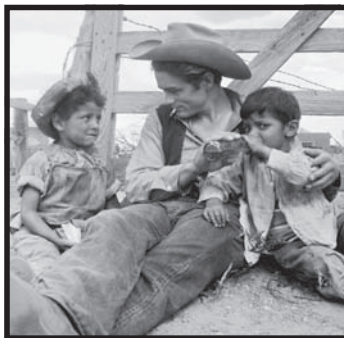
James Dean on location in Marfa, Texas, in 1955.

Voces on PBS “Children of Giant” will be broadcast on 3-2 Sunday, the 13th at 6:30 p.m. On 3-1, it can be seen Sunday, the 20th at 9:00 p.m.