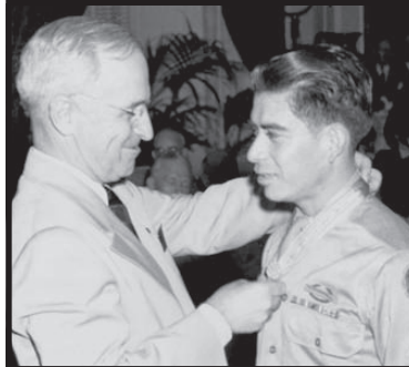
Latino Americans serve their new country by the hundreds of thousands, yet still face discrimination and a fight for civil rights in the United States.

Latino Americans can be seen on 3-2 Mondays at 9:00 p.m. beginning the 7th. It airs on 3-1, Mondays at 8:00 p.m. beginning the 7th.