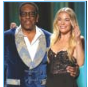
Charlie Wilson and LeAnn Rimes

An Opry Salute to Ray Charles airs on 3-2 Saturday, the 7th at 8:00 p.m. and Sunday, the 15th at 10:00 p.m. On 3-1, it can be seen Sunday, the 8th at 7:00 p.m. and Tuesday, the 10th at 1:00 p.m.