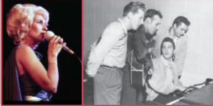
Top LtoR: Ernest Tubbs, Dolly Parton and Hank Williams. Bottom LtoR: Tammy Wynette, Jerry Lee Lewis, Carl Perkins, Elvis Presley and Johnny Cash.