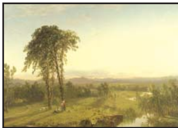
“Summer in New Hampshire” by John Kensett (1852)

This second generation of Hudson River School painters left the New York area to explore more far-flung regions of America. Dur-