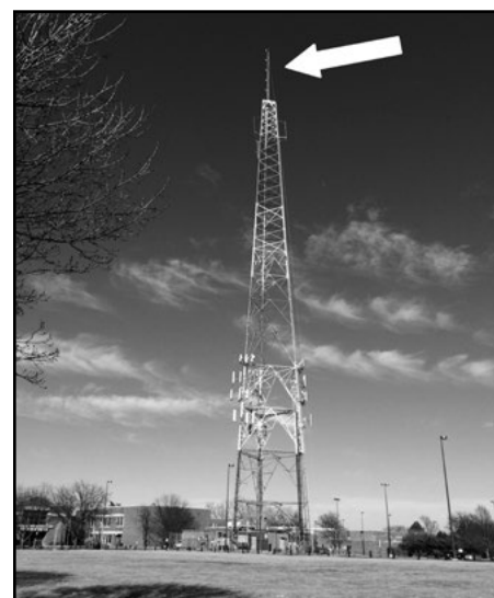
The arrow indicates the location of the recently replaced antenna.

Thank you again for your patience and support.