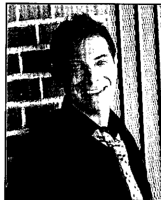
Michael Feinstein hosts Song Travels , heard Tuesdays at 8 pm on KIOS

Song Travels reminds the audience of an era when families would curl up around the radio, listening together as if the radio were inviting them to place themselves into the stories they heard. In fact, we suggest you do cozy up for Song Travels . Whether alone or with loved ones, with a mug of herbal tea or hot chocolate, this show is an opportunity to end your evening with a break from the intensity of news, relax and just listen.