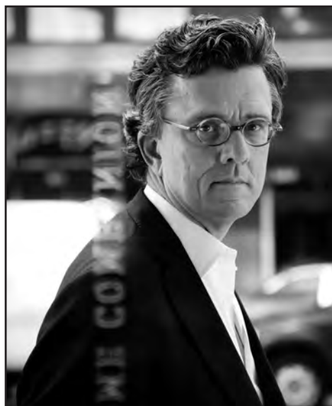
Kurt Andersen, Host of Studio 360

Each week, the show's host Kurt Andersen leads a discussion about what's new or interesting in film, literature and art. But it's not just about entertainment. The show looks at topics which range