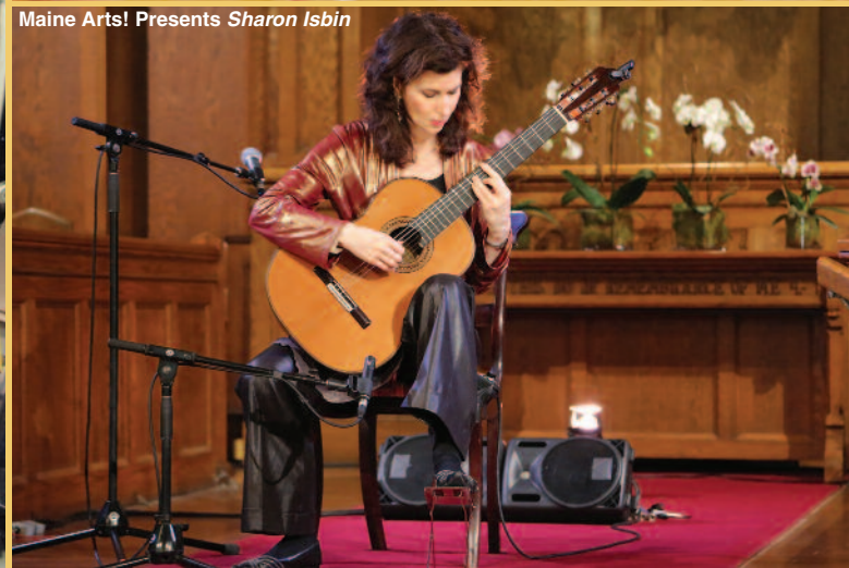
Maine Arts! Presents Sharon Isbin