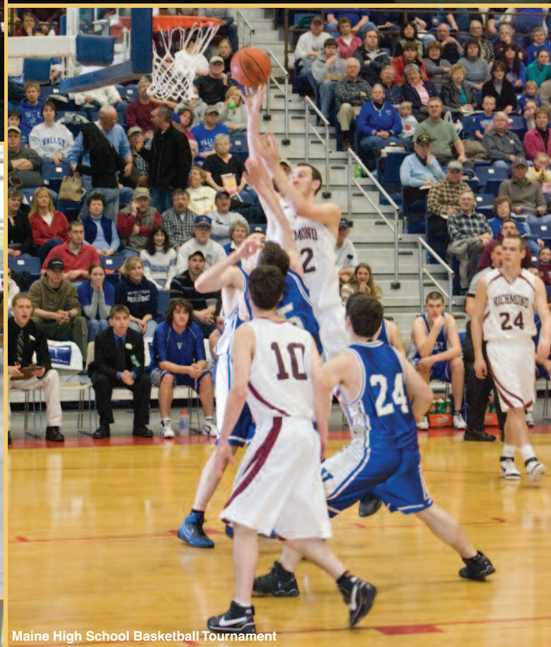
Maine High School Basketball Tournament