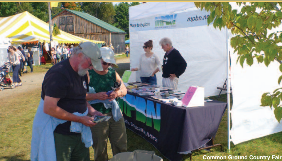
Common Ground Country Fair