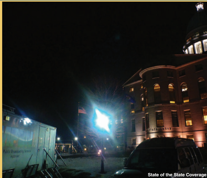
State of the State Coverage