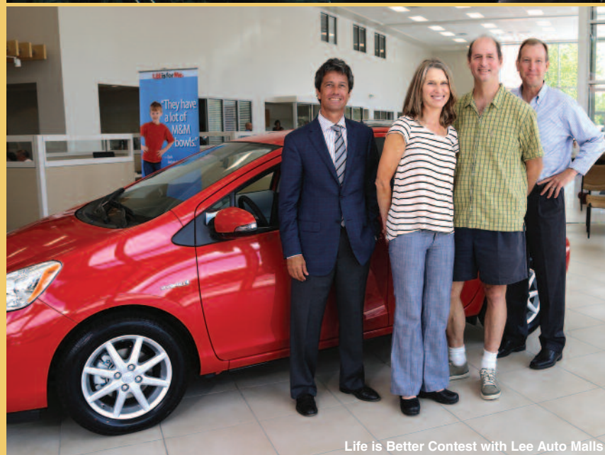
Life is Better Contest with Lee Auto Malls