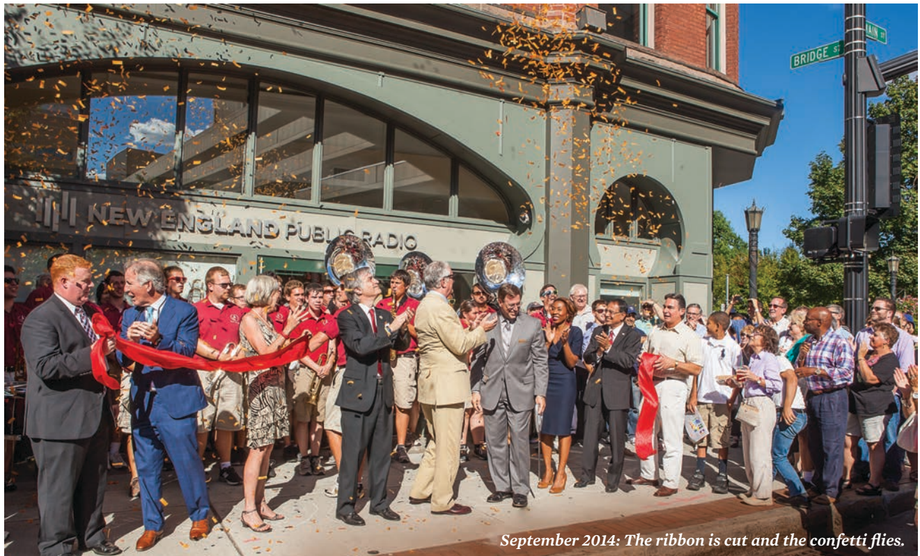
September 2014: The ribbon is cut and the confetti flies.

New England Public Radio Foundation's 50th Anniversary Capital Campaign for WFCR