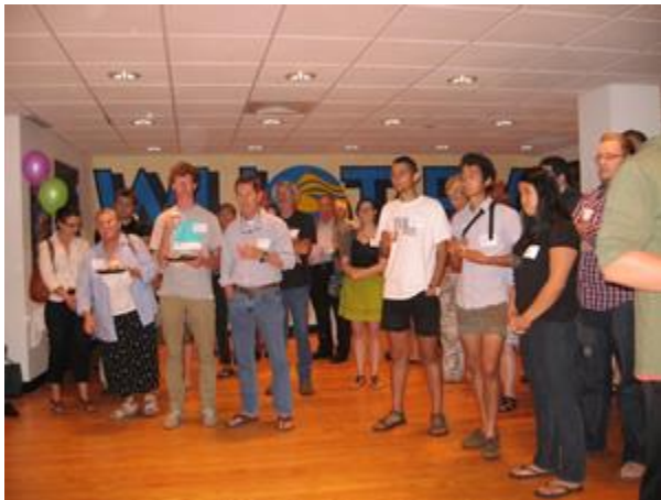
People pack in to hear station updates