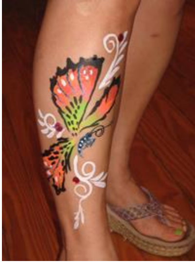
Misung's finished butterfly