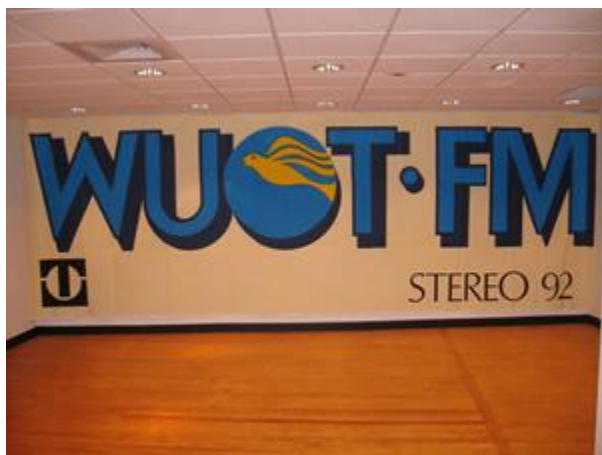
A billboard blast from the past decorates WUOT's space