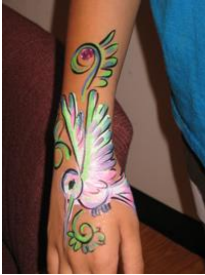
A hummingbird coming to rest on a wrist