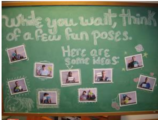
Bailey Callaghan put up samples of celebrities showing their support for NPR to give WUOT open house attendees ideas for their own poses