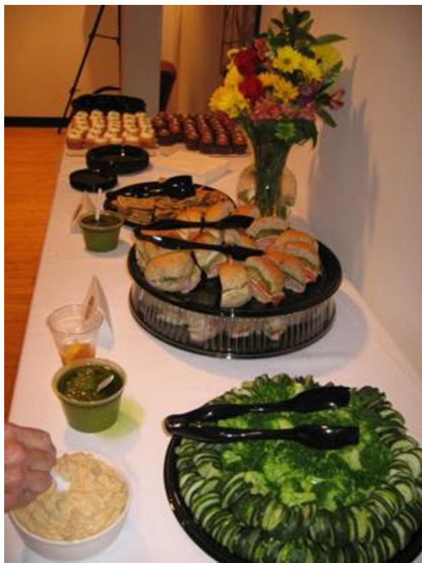
Delicious food from The Tomato Head and Magpies