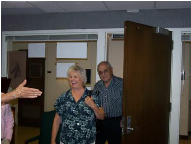
Here attendees were literally greeted with open arms!