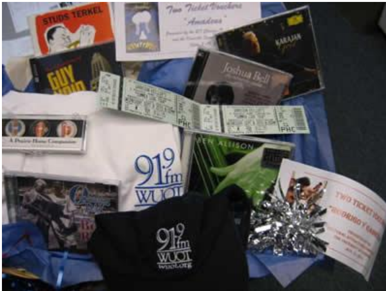
Door prizes abound at the third annual open house and include two tickets to Garrison Keillor's A Prairie Home Companion Summer Love Tour