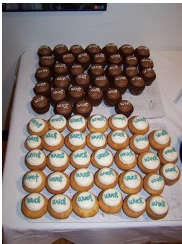
Delicious cupcakes from Magpies