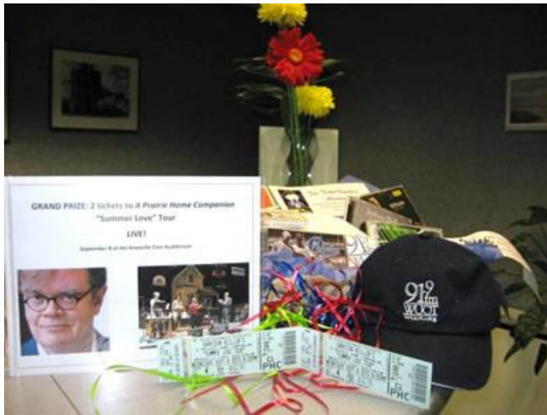
Prize drawings. The grand prize was two tickets to Garrison Keillor's A Summer Love Tour