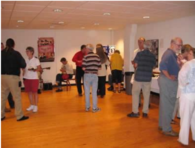
Attendees chat and listen to live music

Thanks to everyone who came to WUOT's open house on August 12! We really enjoyed having you at the station.